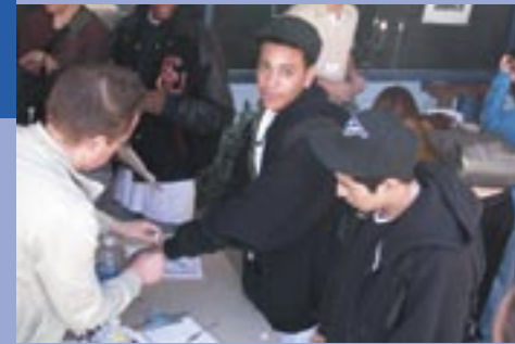
Students met with area employers to explore summer job opportunities.

recipients, alumni, and other Jewish youth ages 16-25 in making a successful transition into the working world, is sponsored by the Newton and Rochelle Becker Foundation.