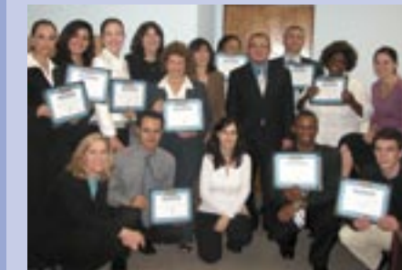
BankWorks graduates with HR representatives from program banking partners.